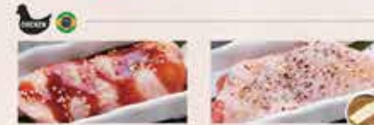
Chicken A1 Teriyaki A2 Garlic A3 Choco Curry A4 Double Pepper

KD7 Adult: $45.80 KD8 Senior: $38.80 KD9 Child: $26.80