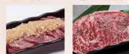
Kintan Karubi A11 Tan A12 Double Pepper