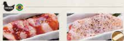
Chicken A1 Teriyaki A2 Garlic A3 Choco Curry A4 Double Pepper

KD1 Adult: $28.80 KD2 Senior: $24.80 KD3 Child: $16.80