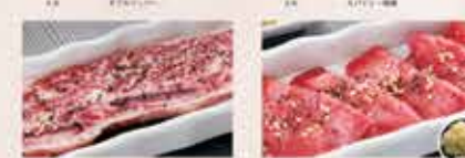
Rosu A13 Tan A14 Double Pepper