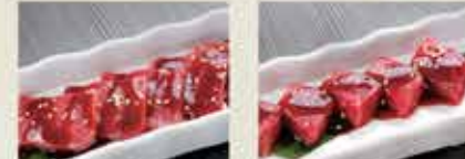
Rosu A13 Tan A14 Double Pepper