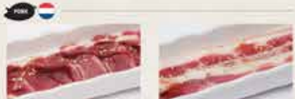
Pork Shoulder A5 Teriyaki A7 Original A6 Garlic A7 Original