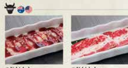
Yakishabu A9 Tan A10 Double Pepper