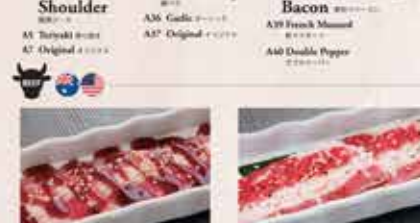
Thick Cut Bacon A39 French Mustard A40 Double Pepper