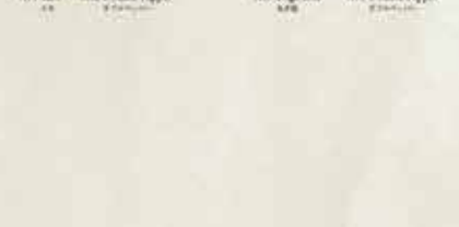
Gyu Tan A17 Nagi Shio A18 Double Pepper