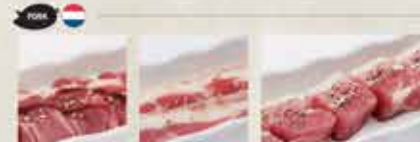
Pork Shoulder A5 Teriyaki A7 Original A6 Garlic A7 Original