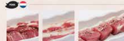
Pork Shoulder A5 Teriyaki A7 Original A6 Garlic A7 Original