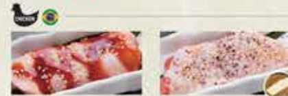
Chicken A1 Teriyaki A2 Garlic A3 Choco Curry A4 Double Pepper

KD4 Adult: $36.80 KD5 Senior: $30.80 KD6 Child: $20.80