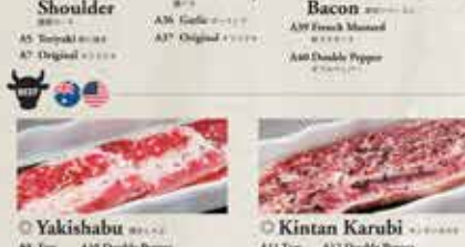
Thick Cut Bacon A39 French Mustard A40 Double Pepper