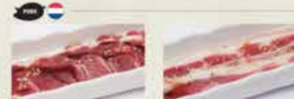
Pork Shoulder A5 Teriyaki A7 Original A6 Garlic A7 Original