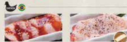
Chicken A1 Teriyaki A2 Garlic A3 Choco Curry A4 Double Pepper

KD10 Adult: $59.80 KD11 Senior: $51.80 KD12 Child: $35.80