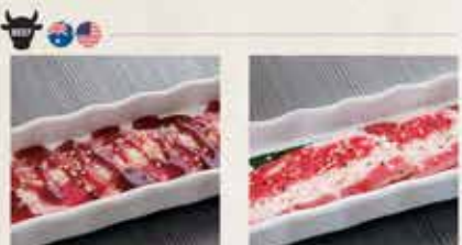
Yakishabu A9 Tan A10 Double Pepper