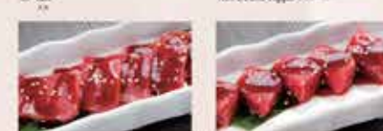
Yakishabu A9 Tan A10 Double Pepper